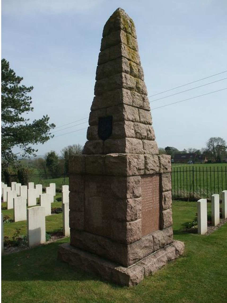
Durrington - Australian War Memorial